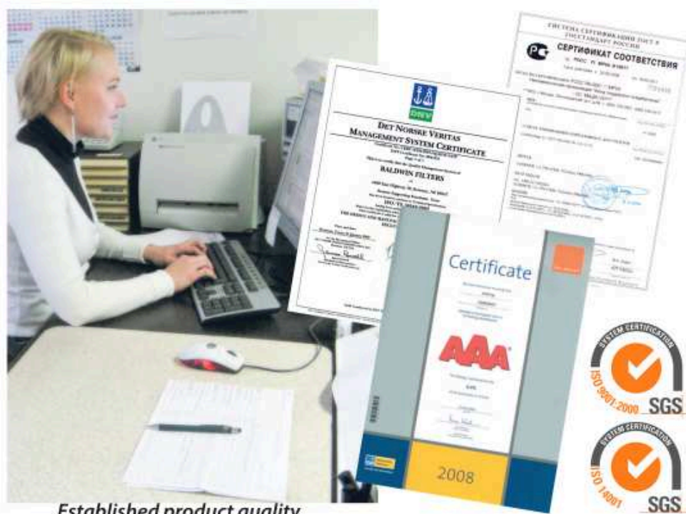
Established product quality

Airfil – established in 1981 – is a modern company with a good financial standing (AAA credit rating) which looks to improve its operations proactively. The company manufactures filters for industry and heavy equipment and is one of the leading filter manufacturers in the Nordic countries. Airfil focuses on providing high-quality products, a diverse product range and prompt deliveries.